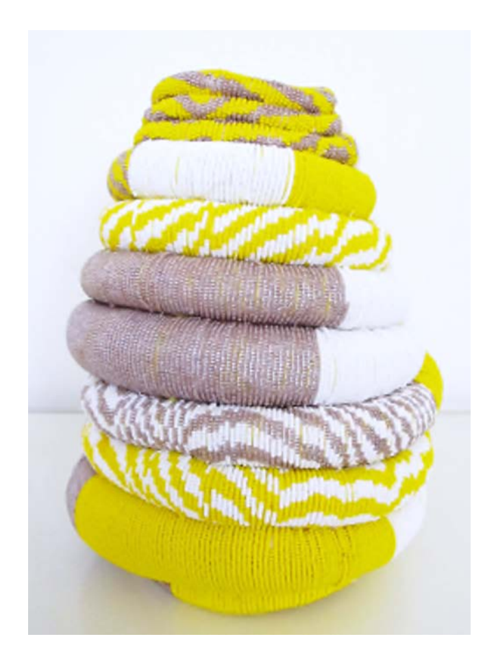
BCXSY Thokozani Sibisi Coiled Vase, 2010 Traditional Czech glass beads, fabric, bottle 10 5/8 x 6 5/16 in. (27 x 16 cm)