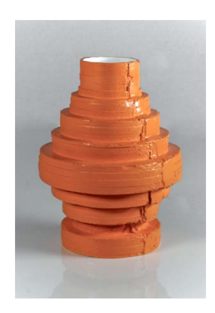
Julien Carretero Drag Vase, 2009 Plaster, lacquer 17 3/4 x 15 3/4 in. (45.1 x 40 cm)

Compare and contrast Julien Carretero's "Drag Vase" (2009), which is also in the exhibition, and "Coiled". What are some formal similarities and differences? Other than their aesthetics, what else do these two works have in common?