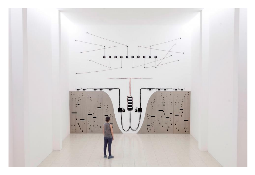
Sonic Arcade: Shaping Space with Sound September 14, 2017 to February 25, 2018

Studio Views also features the Point of View (POV) Gallery, co-curated by the artists, who will draw artwork and supporting materials from MAD's permanent collection in order to contextualize their work within the history of studio-craft practice. The POV Gallery highlights innovators who, like the contemporary artists creating new work at MAD, have expanded the field of craft.